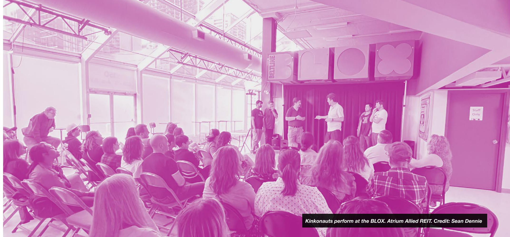
Kinkonauts perform at the BLOX. Atrium Allied REIT.

This program is an amazing example of the huge impact to the community that having affordable space for artists and arts and culture groups provides.