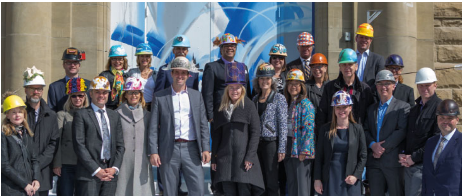
cSPACE partners, shareholders, staff and board wearing their custom hard hats. Thank you from our team to the artists!